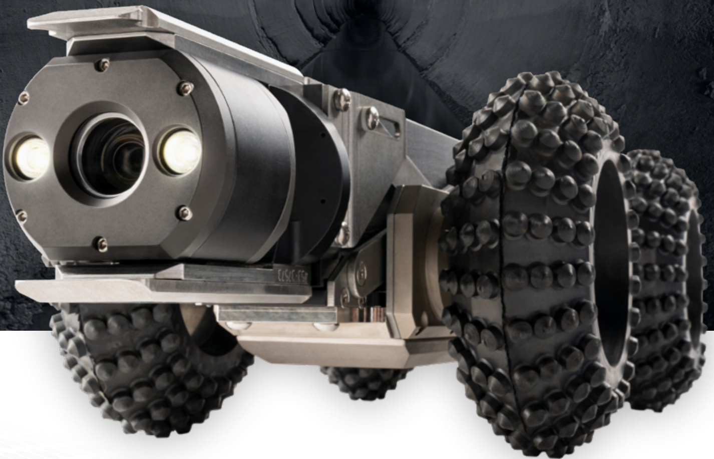
TranStar Utility Inspection Transporter