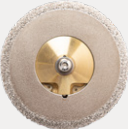
MegaTrak 2.7" / 3.3" / 4.5"