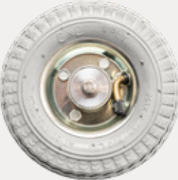
Pneumatics 6" / 8"