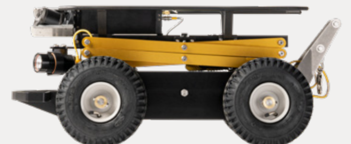
Transporter: Steerable Storm Drain Cameras: TrakStar, TrakStar II