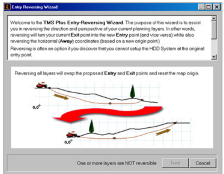
Entry-Reversing Wizard Screen