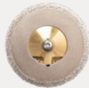
MegaTrak 2.7" / 3.3" / 4.5"