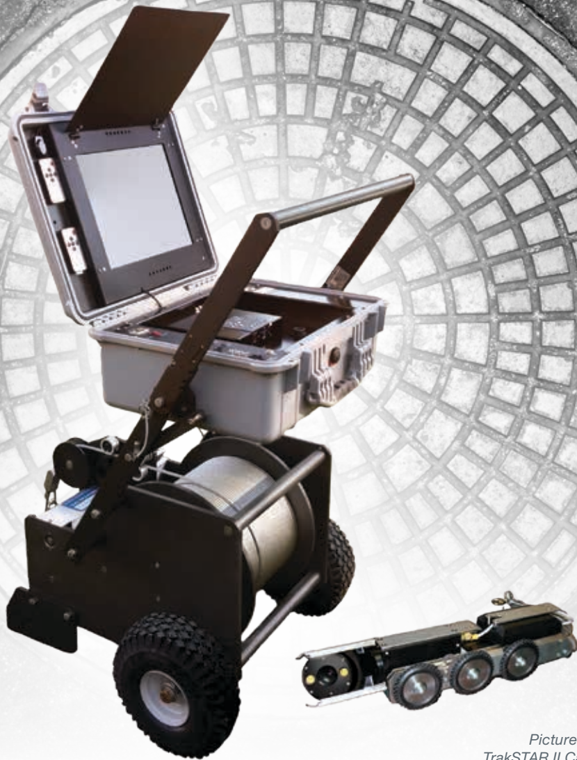
Pictured with TrakSTAR II Camera and TranSTAR II Tractor

This system is the perfect solution for easements, offroad manholes or any hard-to-get-to location. It is also well suited for smaller municipalities or contractors desiring the power and capabilities of a full mainline inspection system in a highly affordable, all-inclusive mobile package.